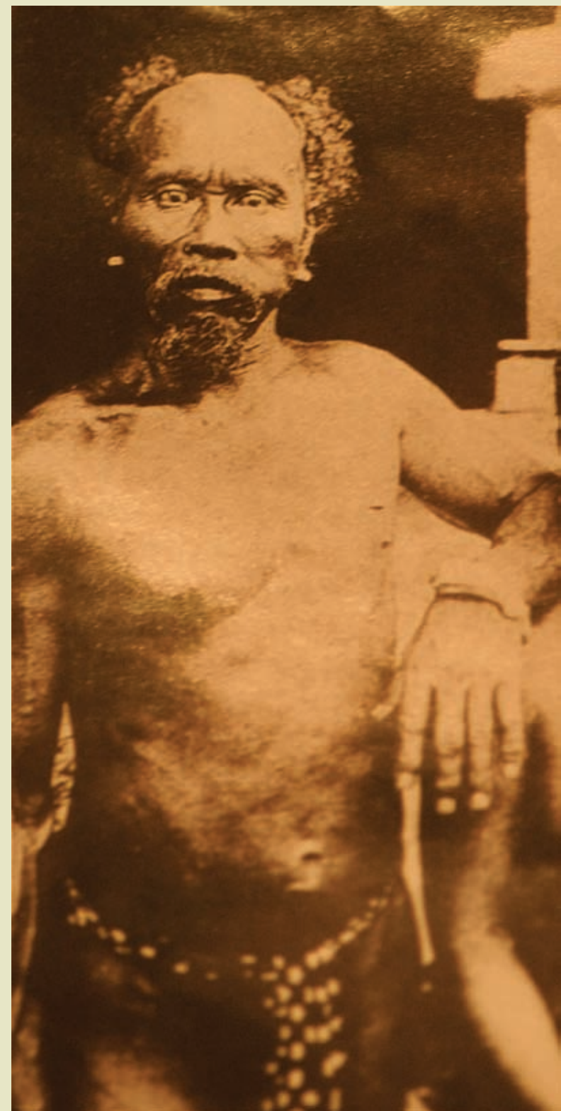
Archival photograph of a Micronesian navigator circa 1901. Records suggest that Chuuk, Palau and Ponape produced the majority of skilled navigators in this region of the Pacific.