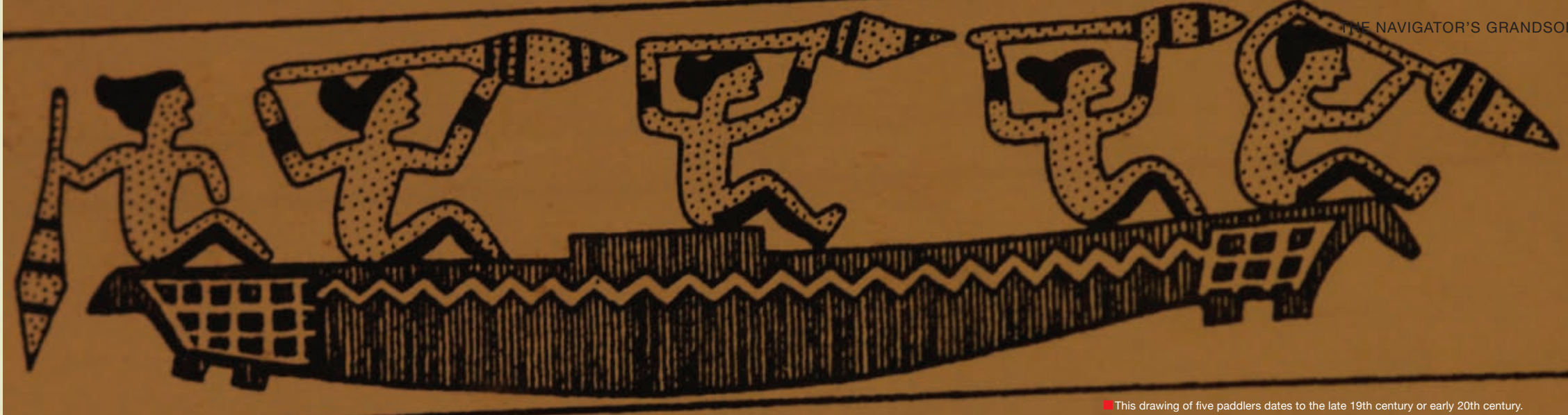
This drawing of five paddlers dates to the late 19th century or early 20th century.

At that point, his Chief Mate, hesitantly, offered a suggestion. He told the captain that when they were in Truk, they'd taken on local crew, among them a young man who was the grandson of the last of