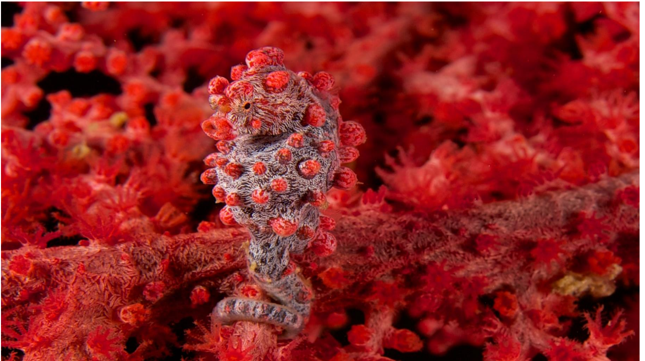
taken on the first ISAM trip