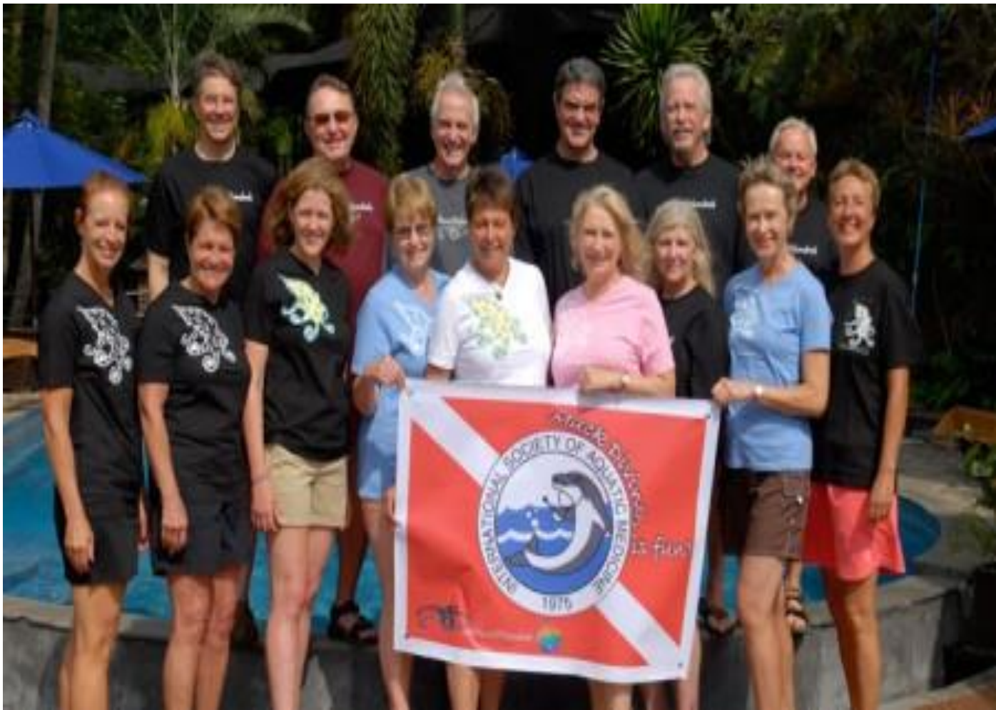
ISAM 's First group trip in 2013